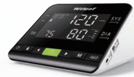
> WIT-B600B: Cuff storage Backlit display Big screen Bluetooth