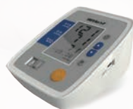
> WIT-B300B: Bluetooth Small size