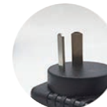
04 AU Plug