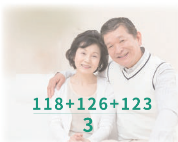
○ Three group average