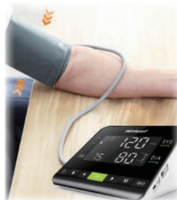
○ Induction pressurization