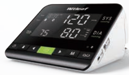
> WIT-B600A: Cuff storage Backlit display Big screen