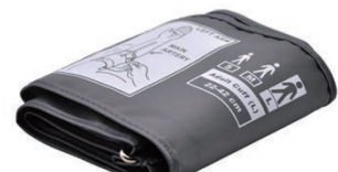
Normal Cuff (Large) / 22~42cm