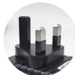
03 UK Plug