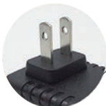
01 US Plug