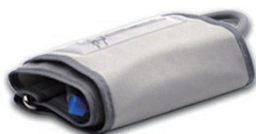
Normal Cuff / 22~32cm