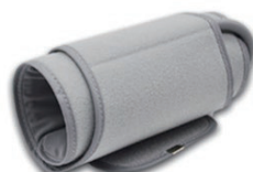
C-shape Cuff / 22~32cm