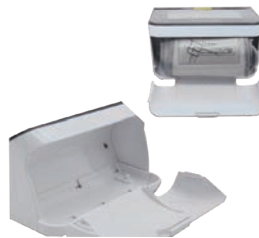
○ Cuff storage