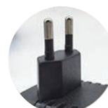
02 EU Plug